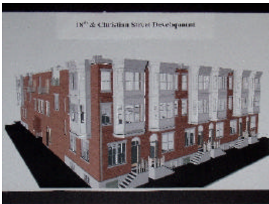
1800-1808 Christian St. — 900 S. 18th St.

S OSNA and the community met with the developer, PH Properties in September and October to review the above 11-unit single family home development. Hardly any of us have been around long enough to remember the Tabor Presbyterian Church that stood at this site although many of us remember the gas station. The ground breaking is expected in the Spring of 2004.